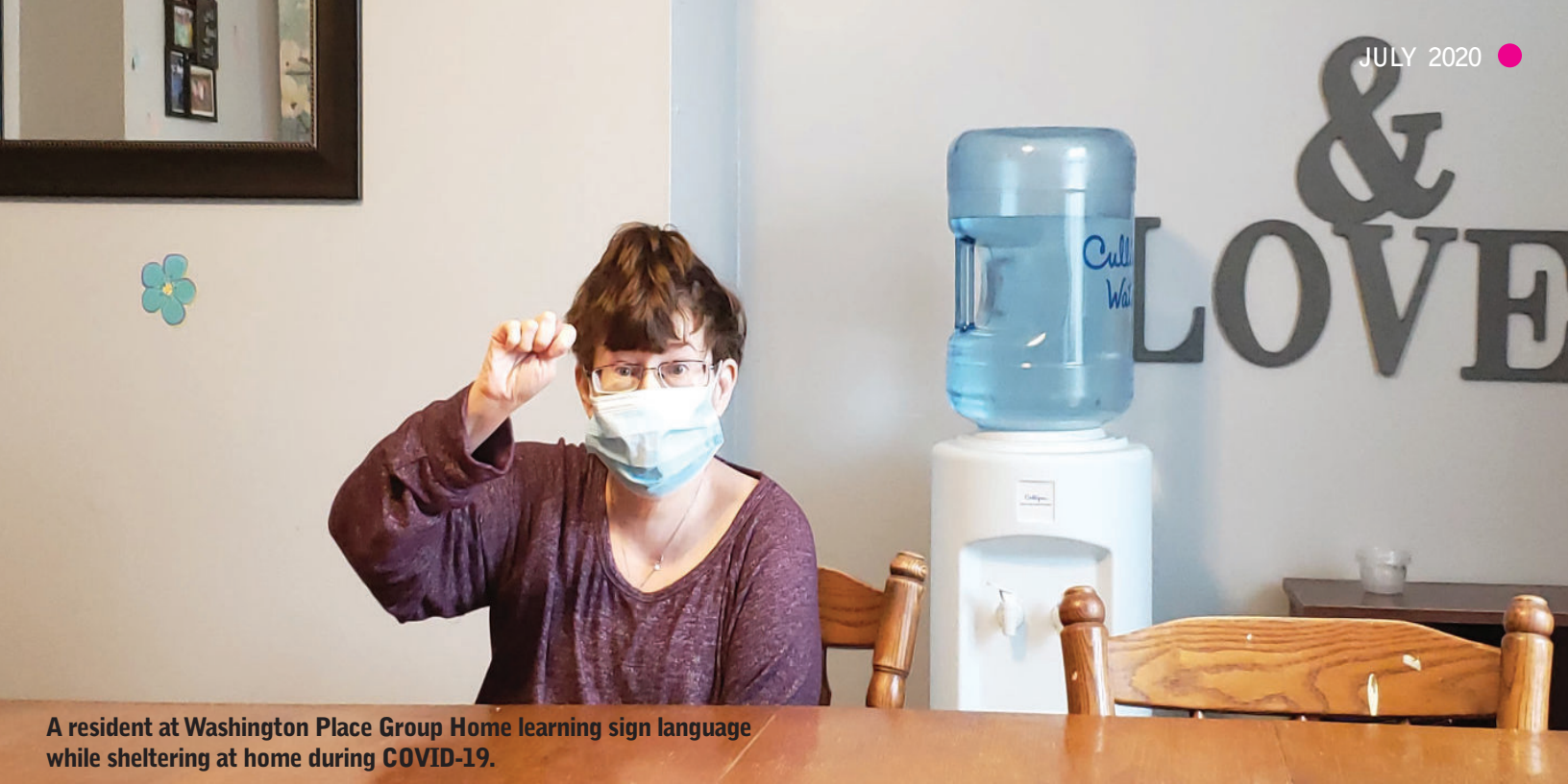
A resident at Washington Place Group Home learning sign language while sheltering at home during COVID-19.