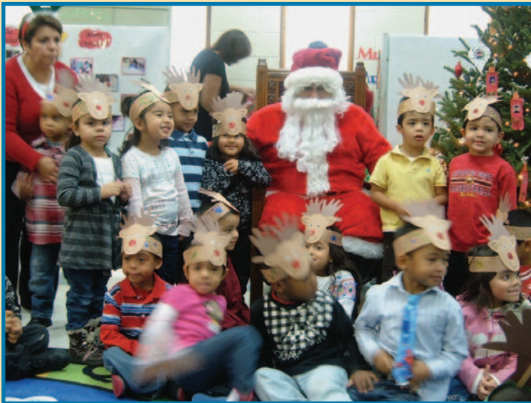
Students at Trinidad Head Start enjoy their time with Santa.